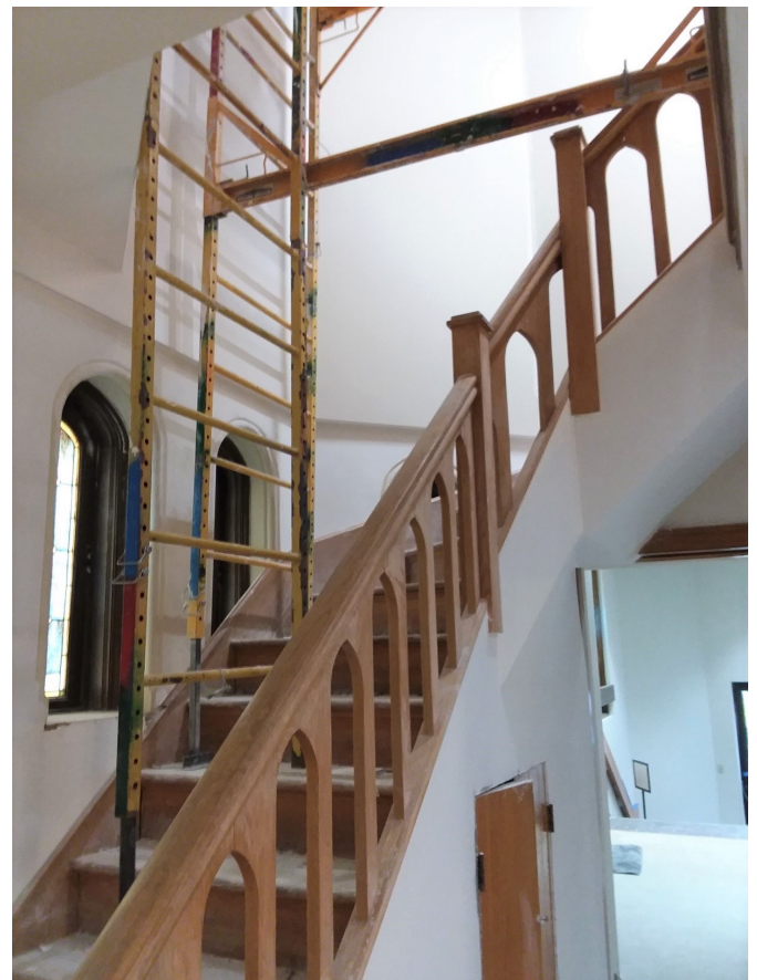
The paneling is gone from the dark stairwell to the choir loft. It's brightened up with drywall and paint.