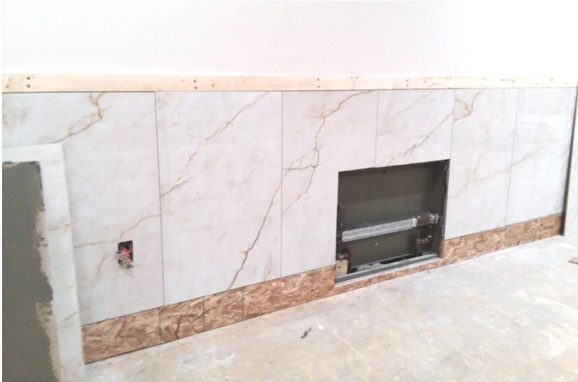
The walls are receiving a wainscoting of porcelain tile that looks like marble.