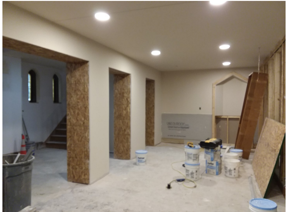
The expanded gathering space is taking shape.