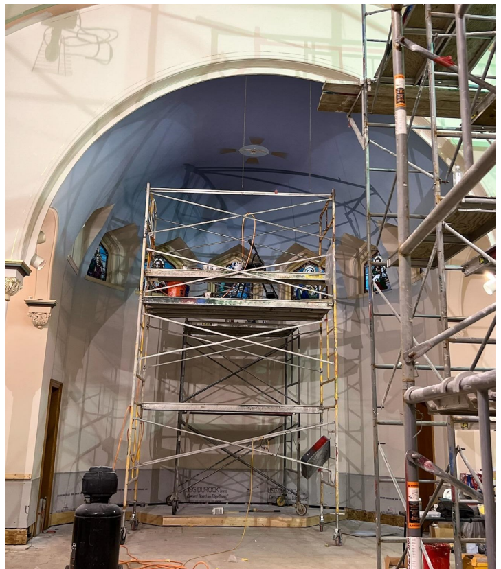
The ceiling over the sanctuary looks like a clear blue sky.