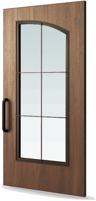
This is similar to what our new exterior doors will look like.