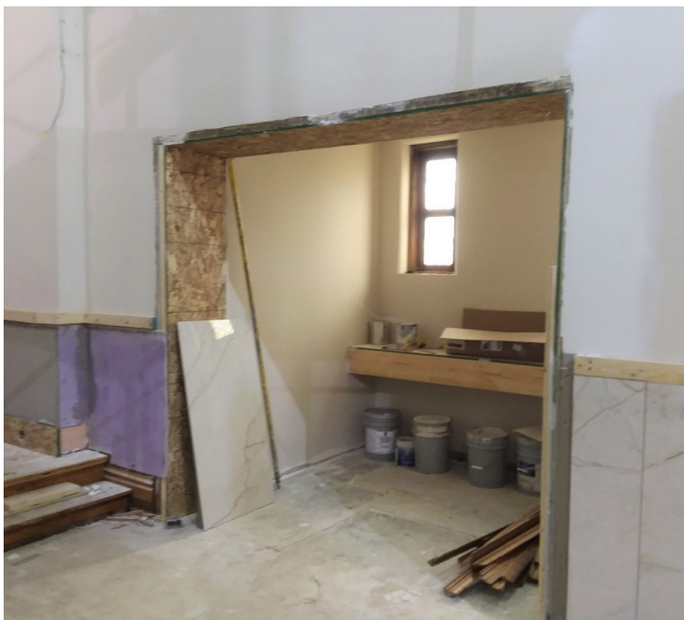
The old confessional on the south wall is being turned into a devotional alcove. It'll hold icons, votive candles, and kneelers.