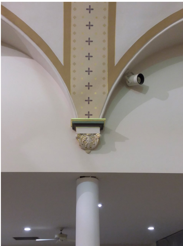
We have round columns between the old part of the church and the north extension. The pink and green color scheme is changing to tan with purple and green accents.