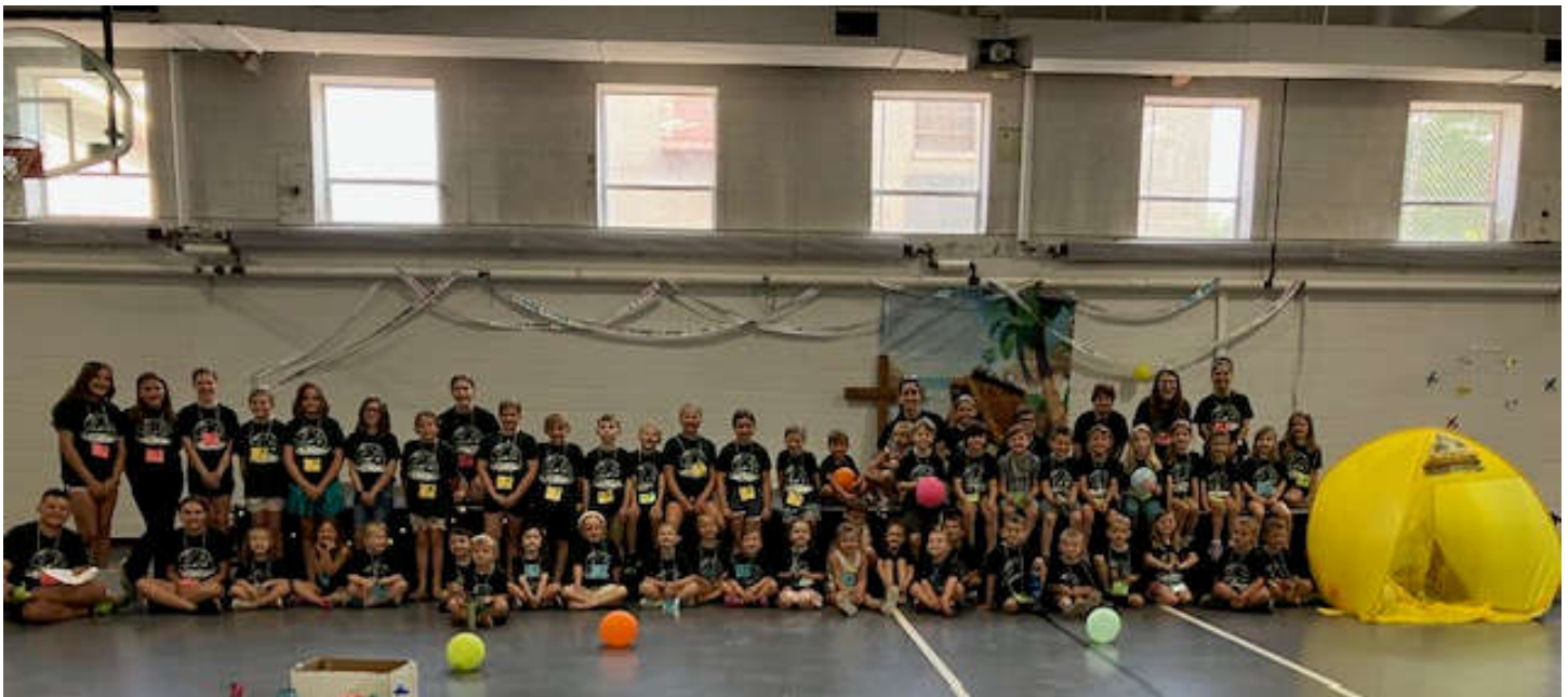
2023 Vacation Bible School group photo.

The children had a great week learning about prayer, saints, making crafts, playing fun games and learning few new dance moves. What a great way to start the summer! See you next year!